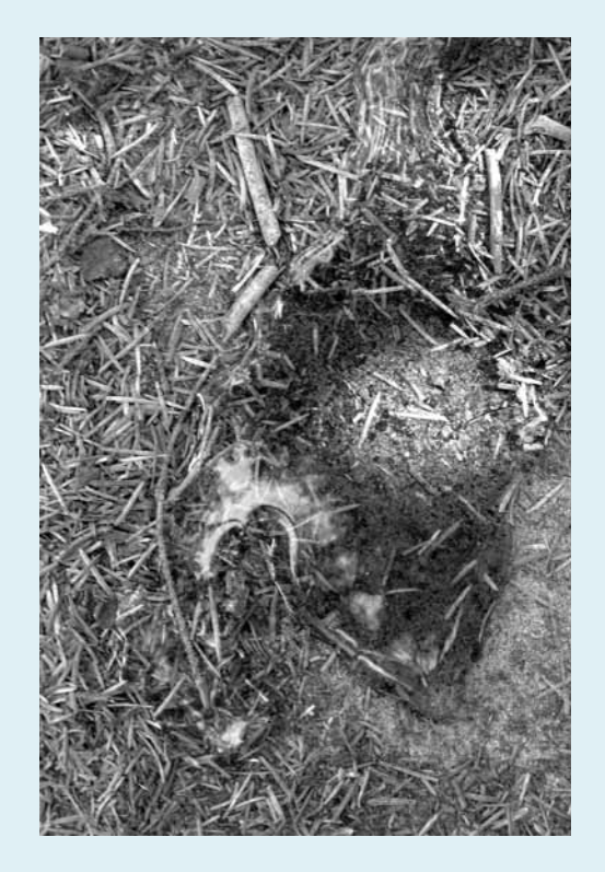
The small puddle of water pictured has been sitting on this sandy soil for over five minutes. A repellency layer has stopped it from infiltrating. Water repellence is more common in sandy soils that grow resinous plants.

The remedies for breaking repellency include turning over the top 2" of soil with a shovel, scratching the soil with a stiff rake, mixing clay into the soil, applying pulse irrigation (brief irrigation many times a day), and mulching the soil to cool it and provide a water holding layer.