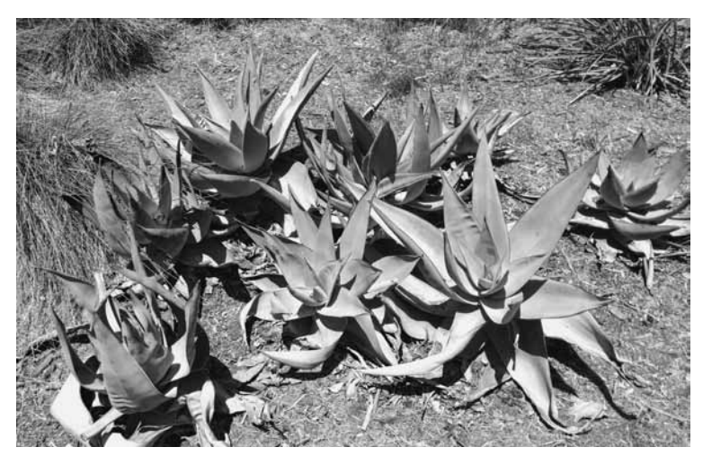
This patch of Aloe striata is showing the signs of under-watering with shriveled leaves, dying older leaves, and stunted new growth.