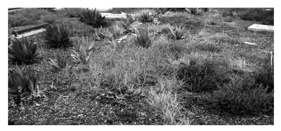
Nutgrass ( Cyperus spp.) is not compatible to the conditions that favor rosemary and yucca. Its presence indicates this landscape is being over-irrigated.

Chickweed, clover, dandelion, dichondra, dock, English daisy, nutgrass, oxalis, pennywort and plantain.