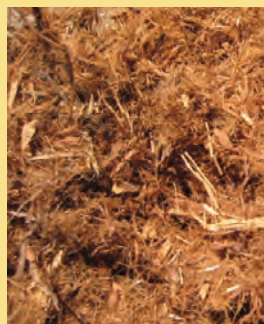
"gorilla hair" shredded wood

While these mulches are commercially available, and some are organic materials, they are not recommended. For example, dyed mulches are composed primarily of recycled wood materials such as treated or painted furniture or wood pallets. Shredded redwood or cedar present significant fire hazards. Gravel and rubber are not eligible for the rebate, do not decompose to feed the soil microbes, and raise the temperature of the entire landscape.