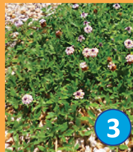
3 Phyla nodiflora Common Lippia