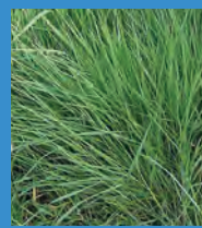
Agrostis pallens Bent Grass