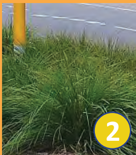
2 Lomandra longifolia 'Breeze' Dwarf Mat Rush