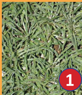
1 Dymondia margaretae Silver Carpet