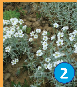
2 Cerastium tomentosum Snow In Summer