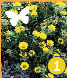
1 Asteriscus maritimus Gold Coin Plant