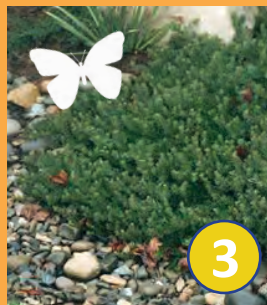
3 Arctostaphylos edmundsii 'Carmel Sur' Creeping Manzanita