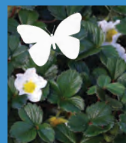
Fragaria chiloensis Strawberry