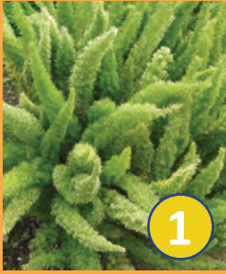
1 Asparagus densiflorus 'Myers' Myers Asparagus Fern