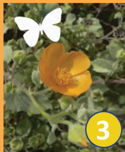
3 Abutilon palmeri Indian Mallow

Naturally low-growing hedges may be planted using a wide variety of drought-adapted shrubs that grow no taller than 3' - 4'. These can be used to screen seating areas or create kid-height enclosures with interiors easily seen from nearby patios and walkways.