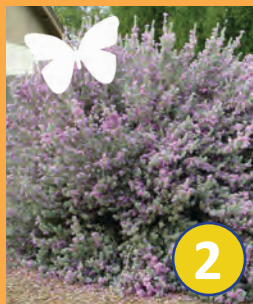
2 Leucophyllum frutescens Texas Sage