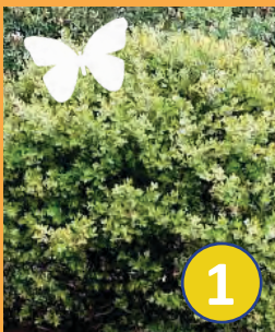
1 Arctostaphylos 'Sunset' Sunset Manzanita