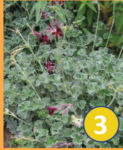
3 Pelargonium sidoides Geranium

Blooming all summer, and repeatedly throughout the year, bushy perennial plants will bring flowers, butterflies, and hummingbirds to sunny patio containers with just weekly watering and a gentle annual haircut.