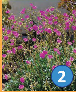
2 Cistanthe grandiflora Rock Purslane