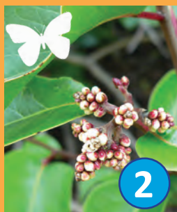
2 Rhus ovata Sugar Bush