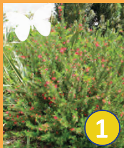
1 Grevillea rosemarinifolia Rosemary Grevillea