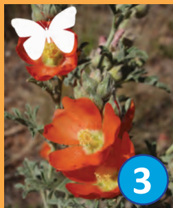
3 Sphaeralcea ambigua Desert Mallow

Choose long flowering plants and shrubs to reduce deadheading duty and keep the garden looking tidy with just one or two big clean ups a year.