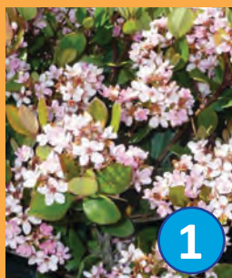
1 Rhaphiolepis indica India Hawthorn