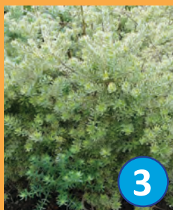
3 Westringia fruticosa 'Morning Light' Coast Rosemary

Select evergreen shrubs (shrubs that don't lose their leaves) to provide year-round interest and create a neutral backdrop for flowering perennials. Be sure to correctly space these plants for fire safety, especially on hillsides (see p. 57).