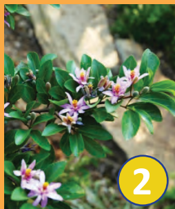
2 Grewia occidentalis Lavender Starflower