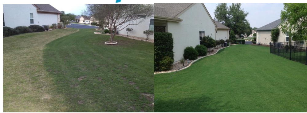
Both yards had AquaSmart PRO and Baseline moisture sensors installed in 2013. The result was a 30% water saving over the previous year with improved turf performance.